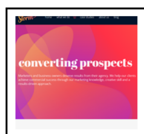
Horsham District Graphic Design Agency.