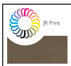
Horsham based print and design company.